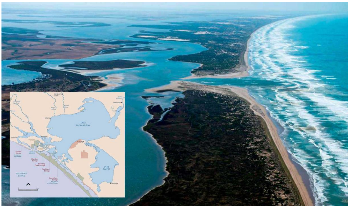
Figure. 1 – The Study Area (The Murray River below Wellington, Lakes Alexandrina and Albert, The Coorong and Murray Mouth).